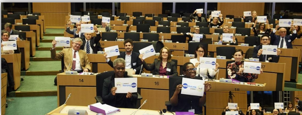
EFN event – 5 February 2020, European Parliament

Unfortunately, COVID-19 hit us all very hard all over the world, and obliged us to lockdown, and to the cancellation of most of the meetings and to reduce our activities next to the EU Institutions, at least physically, as all our meetings at EU level are now ongoing through online platforms, except for the frontline, working in very difficult conditions to save our lives.